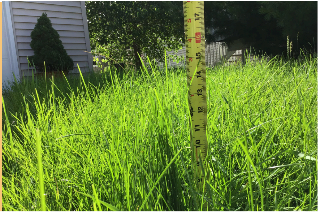
*Example shows a tall grass and weed violation