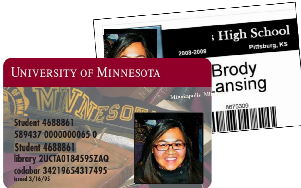
Minnesota university / college / technical college or high school ID card