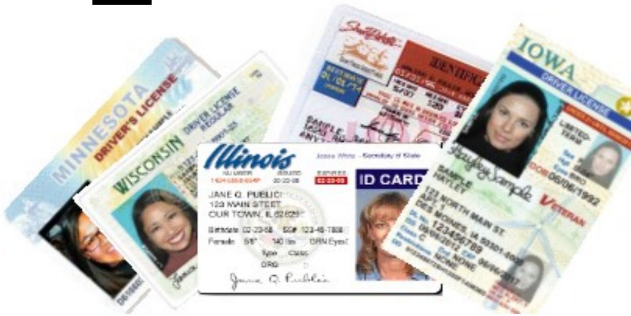
ANY STATE Driver's License, ID Card, Learner's Permit

Of these with current name - Old Address or no address okay/ May be Expired)