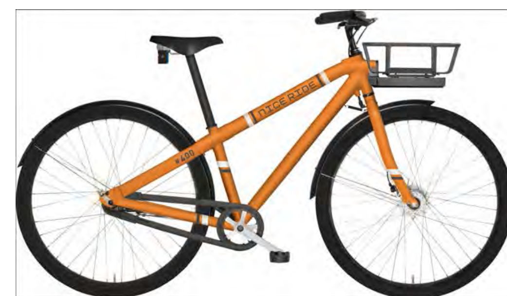
Pictured above is the design of the Nice Ride Bemidji bike share bicycles that were rolled out in 2014. The Bemidji bike share application is similar to the Nice Ride Centers concept recommended for the DMC Development District. These bicycles would be lighter than station-based bike share bicycles provided by Nice Ride.