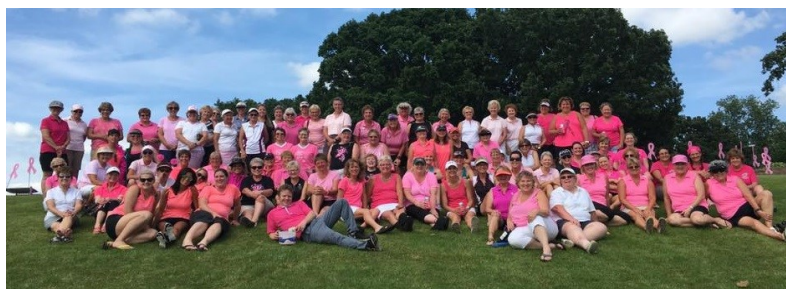
Many of the tournament field for the 2017 Breast Cancer Tournament hosted by Northern Hills GC

Of the nearly 500 golf courses in Minnesota, approximately 425 are available for public play.